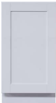
Shaker Hill (SH)